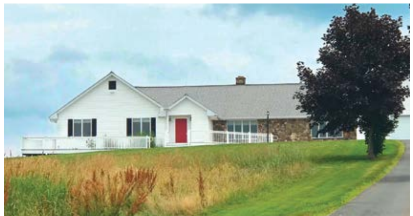
Litchfield Group Home